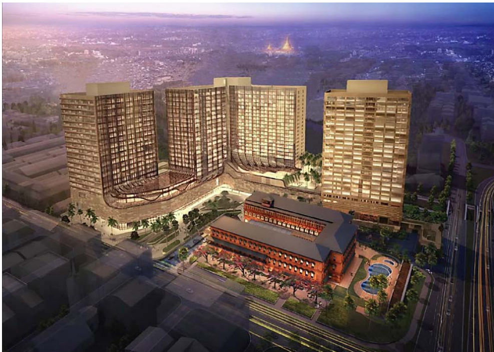
(the lower building in the foreground is the separate project)