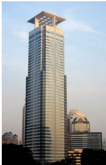
Sinarmas MSIG Tower